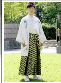
③ Feudal lord (2)