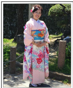
⑥ Kimono (12)