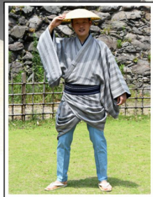
② Peddler (5)