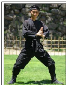
⑩ Ninja • adult (25)