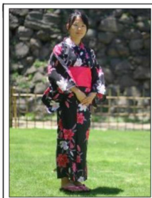
⑨ Yukata (15)