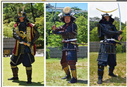
① Armor (6)