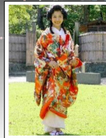
③ Princess (2)