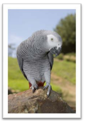
African Gray Parrot

Wow, Congo this is a good crowd, do you think they're cute? Congo they think you're cute too. In fact many people might think parrots are so cute that they want to get one as a pet, however in some cases this can cause direct harm to the wild population of parrots as people will steal little gray guys like this to sell them illegally into the pet trade. Congo has heard of this and he doesn't like it one bit. In fact he can sum up the exact feelings with one very eloquent expression. Do you guys want to hear it? Congo, tell all these people, what are your feelings on poachers? It's a feeling that comes from deep within. Wow Congo they think your funny. He cracks himself up too.