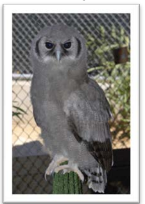
Milky Eagle Owl