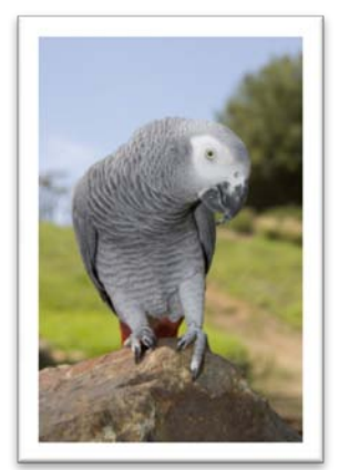
African Gray Parrot