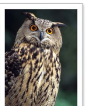
Eurasian Eagle Owl

Ladies and gentlemen that was Taji, our East African Crowned Crane.