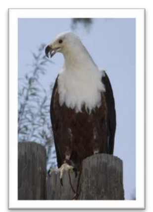
African Fish Eagle