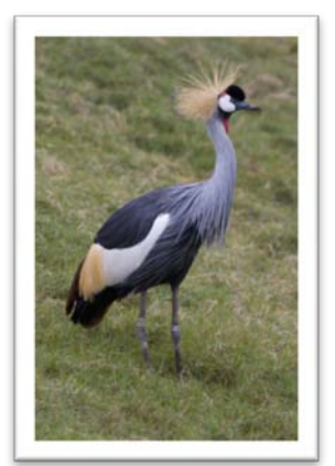
East African Crowned Crane