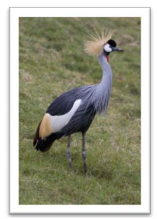
East African Crowned Crane