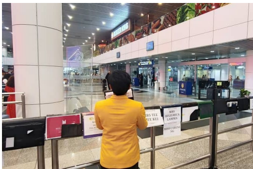
Airport team is yellow jacket is paging for you. paging for you.