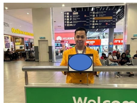
Please look out for Airport team in yellow jacket