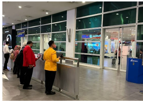
Exit to the arrival gate on your left