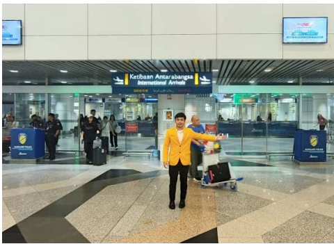
Look out on your left