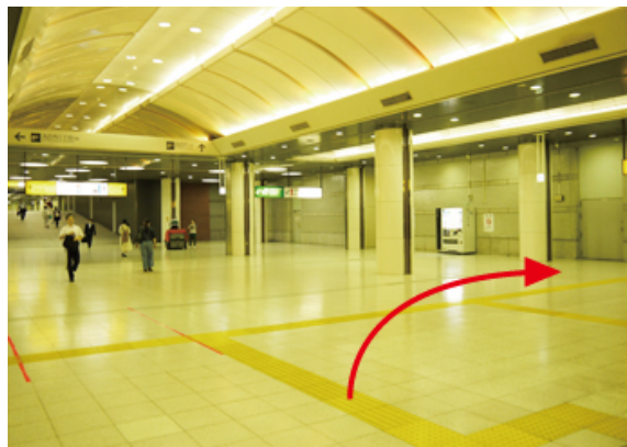
2.After exiting, turn right.