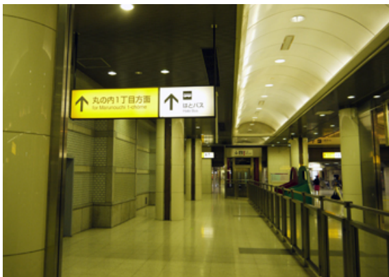
3.Follow signs for Hato Bus to Exit 3.