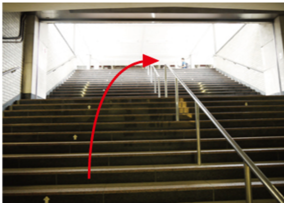
3.Go upstairs and turn right.