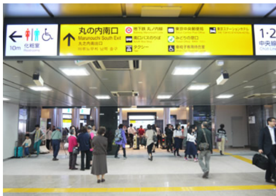
1.Exit from the Marunouchi South Exit.