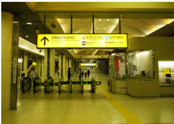
1.Exit from the Keiyo Marunouchi Exit (B1).