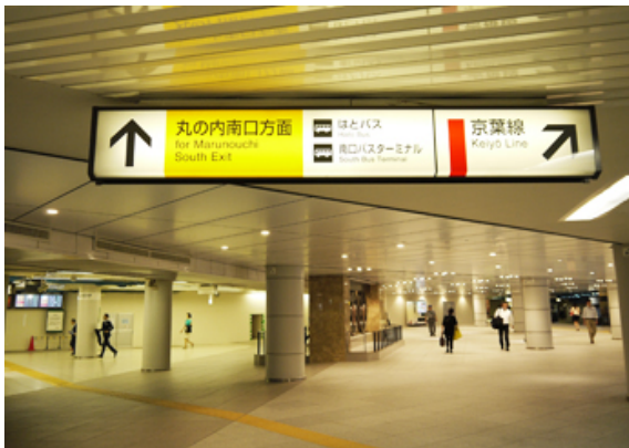
1.Follow signs to the Marunouchi South Exit.