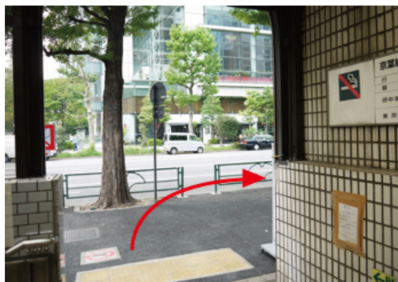
4.Go up the stairs at Exit 3 and turn right.