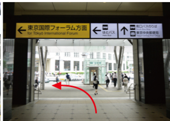
2.After exiting, turn left.