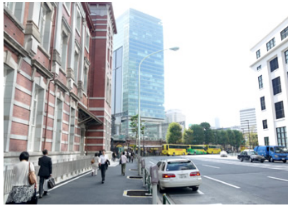
4.The bus stop with yellow buses is just ahead.