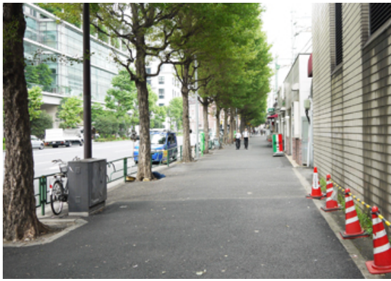
5.Walk straight to the Hato Bus stop.