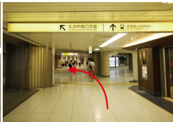
2.Stairs to ground level are ahead.