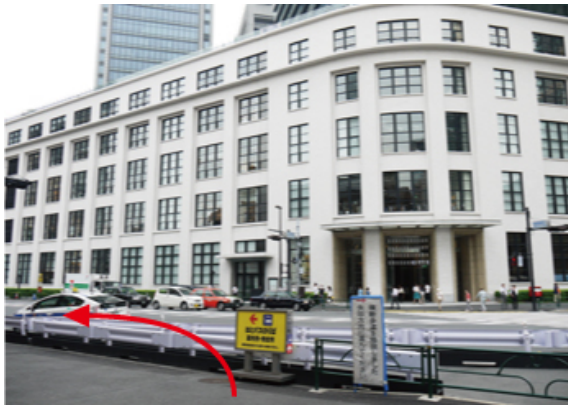
3.Walk along the buildings.